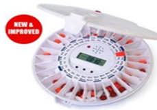
Auto Pill Dispenser dispenses the correct pill at the correct time