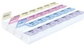
7-Day Medicine Planner